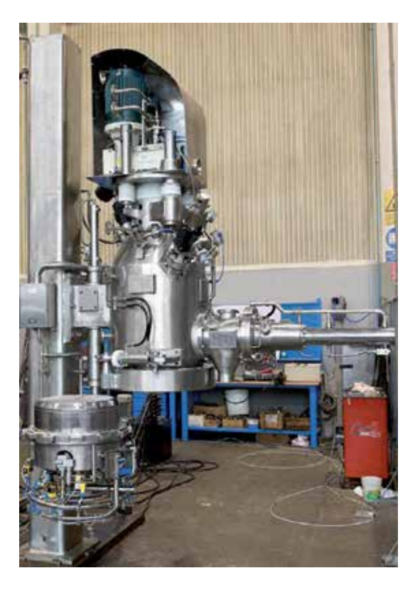
Pressofiltro® agitated Nutsche filters / filter dryers in steam sterilizable design.